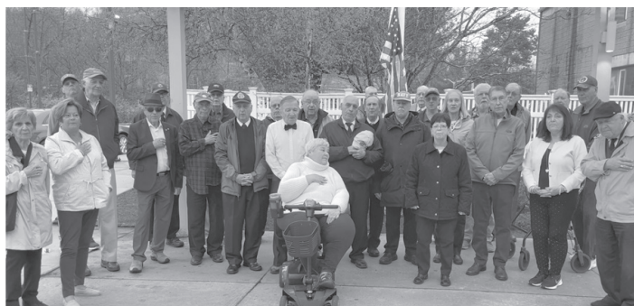
May 1st, 2024 – A group of Retired Friends Club of Greendale members sang the National Anthem while the new US flag, which flew at the US capital, was proudly raised in front of the YMCA.