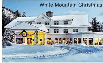
White Mountain Christmas