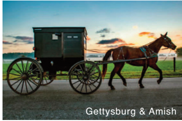
Gettysburg & Amish