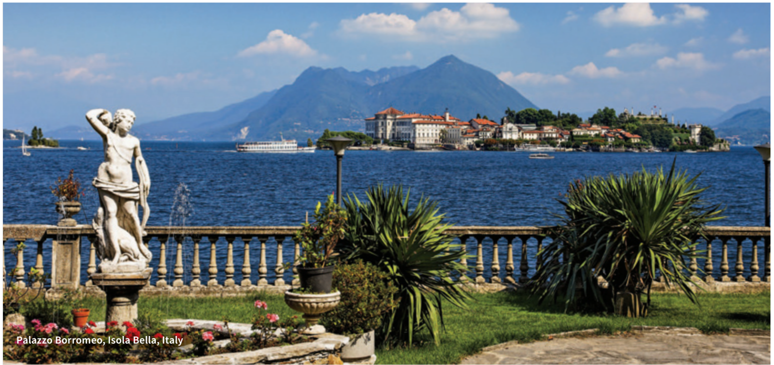
Palazzo Borromeo, Isola Bella, Italy